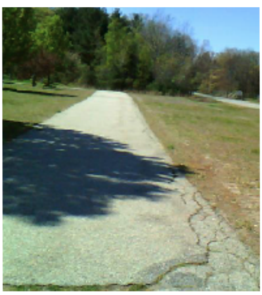
Webster Memorial Beach Trail, Webster MA