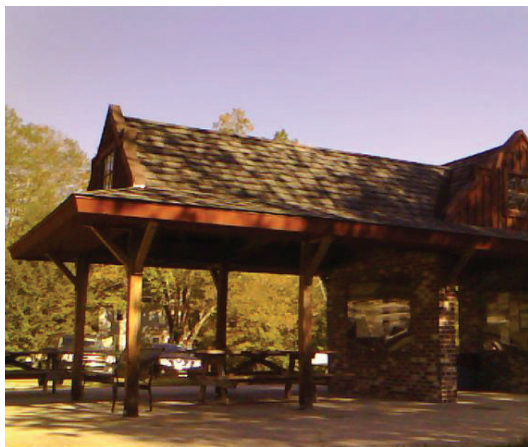
Kiosk and Picnic Area at Pomfret Railroad Station Trail